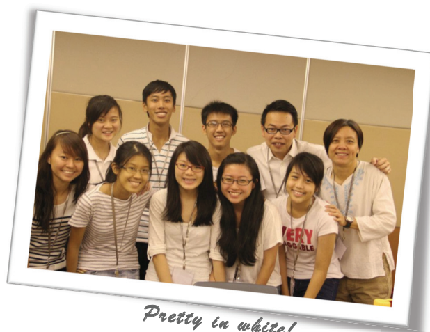
Pretty in white!