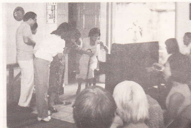
MEMBERS OF TMC GIVING A SKETCH AT WOODBRIDGE HOSPITAL