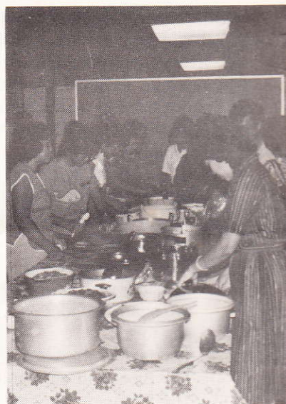
POT-LUCK DINNER, 31. 12. 82