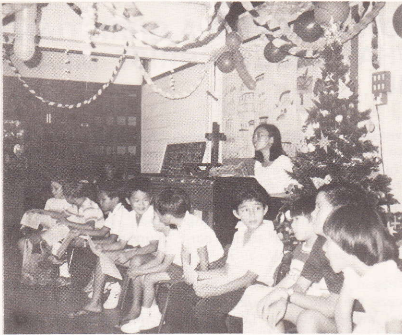
SUNDAY SCHOOL AND MYF CHRISTMAS PARTY