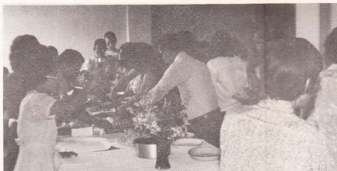
CHRISTMAS PARTY AT WOODBRIDGE HOSPITAL