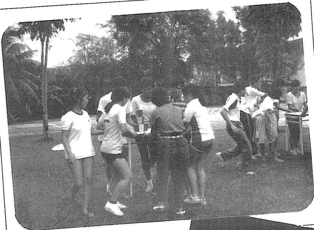
Games Day - This is the way you serve coffee.