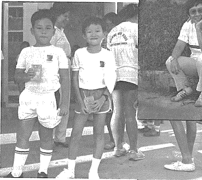
We can still walk a whole lot more!