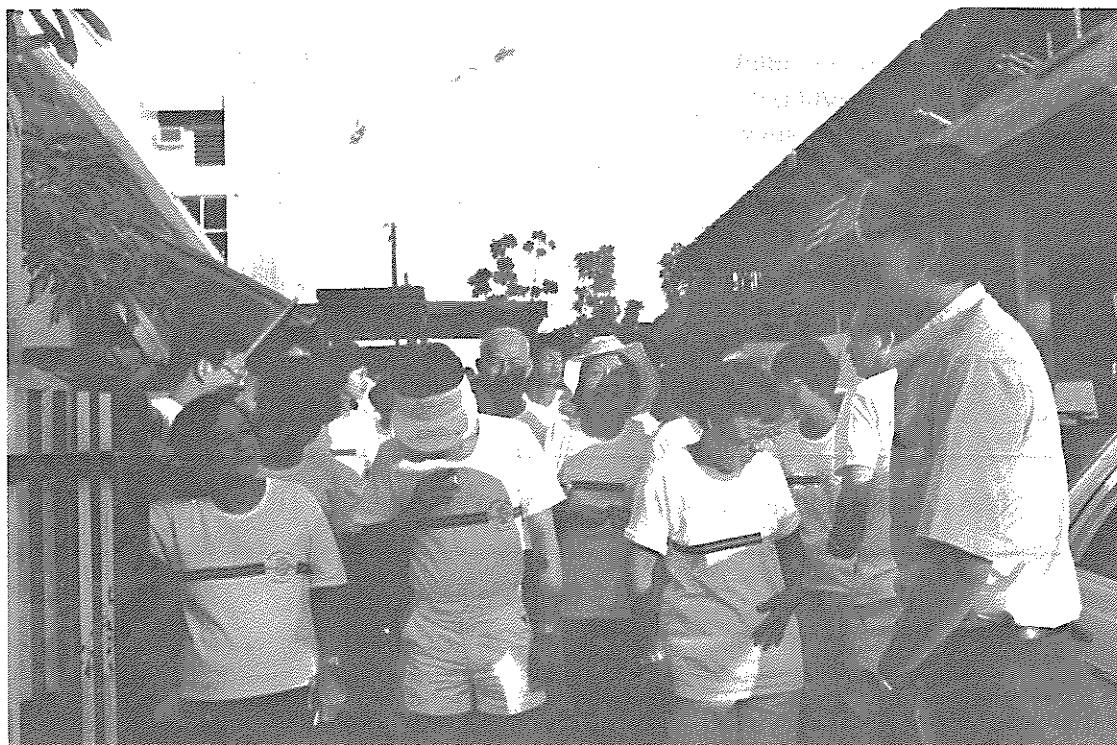
We're ready for the take-off!