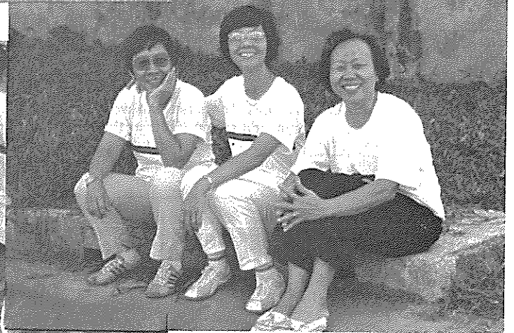
Just a bit of rest by the roadside.....