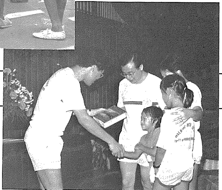
The 'pot of gold' at the end of that long walk