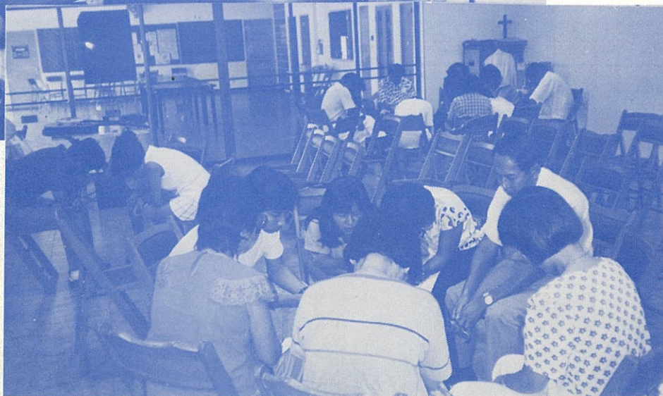
A time for Group Prayers to commit the plans to God.