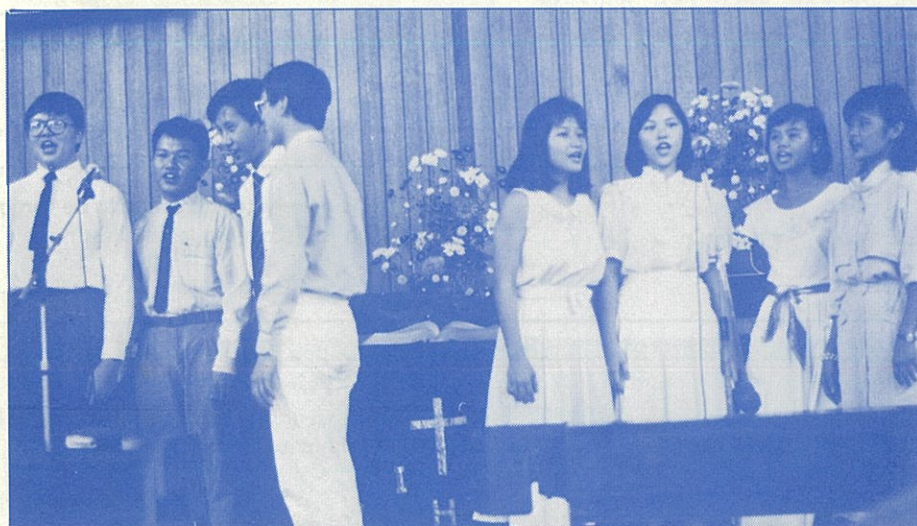
MYF members presenting a song item on MYF Sunday.