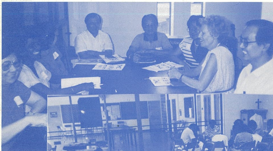
Social Concerns Discussion Group.