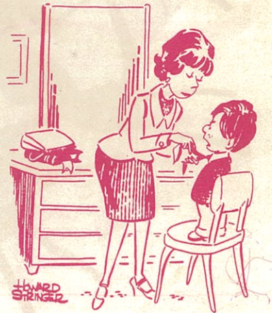
JESUS DIDN'T HAV' TO WEAR A TIE TO CHURCH.

Since many church members never attend Sunday school, the "who needs it" question deserves attention. Just to get this question in focus, let's assume the church has no Sunday school. What difference would it make?