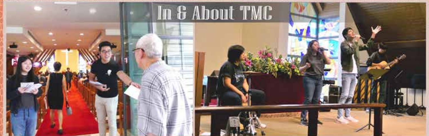
In & About TMC