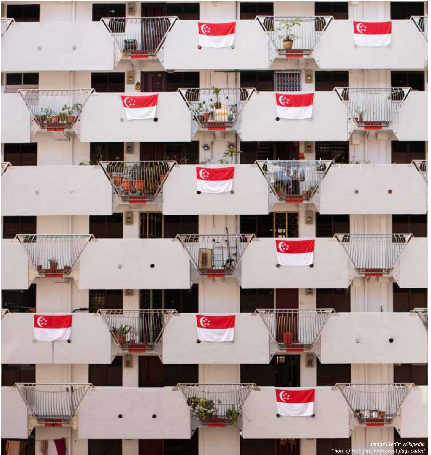
Photo of HDB flats with event flags edited