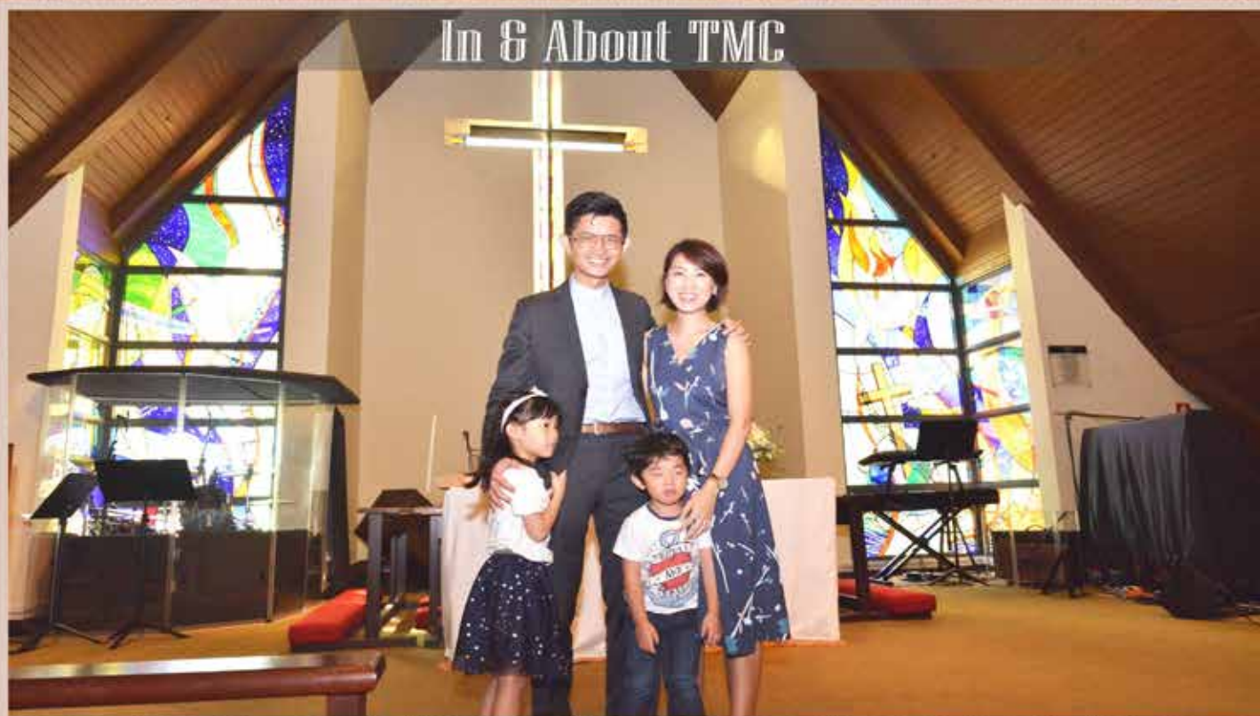
In & About TMC