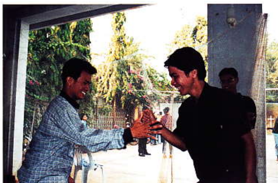
Two youth leaders enjoying themselves at games we organised