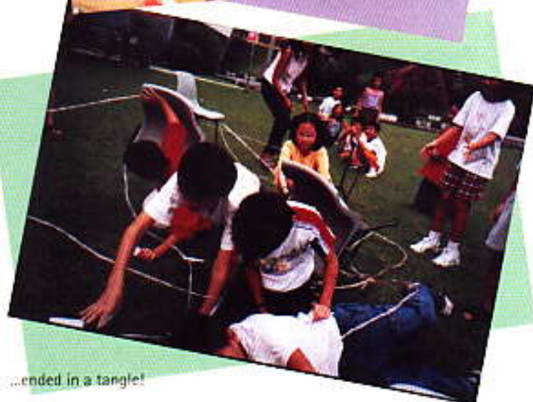
...ended in a tangle!