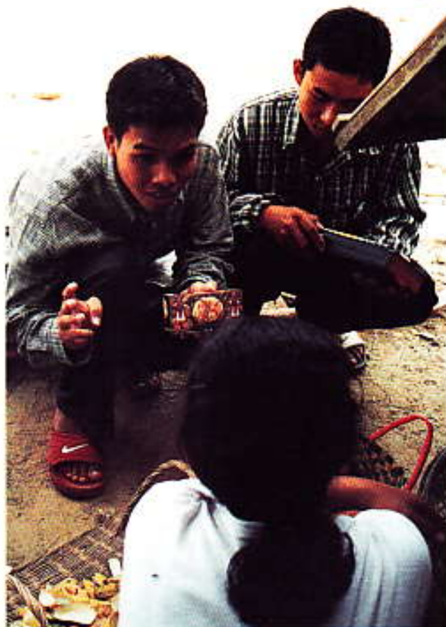
Sharing on the streets of Phnom Penh with a gospel message cube