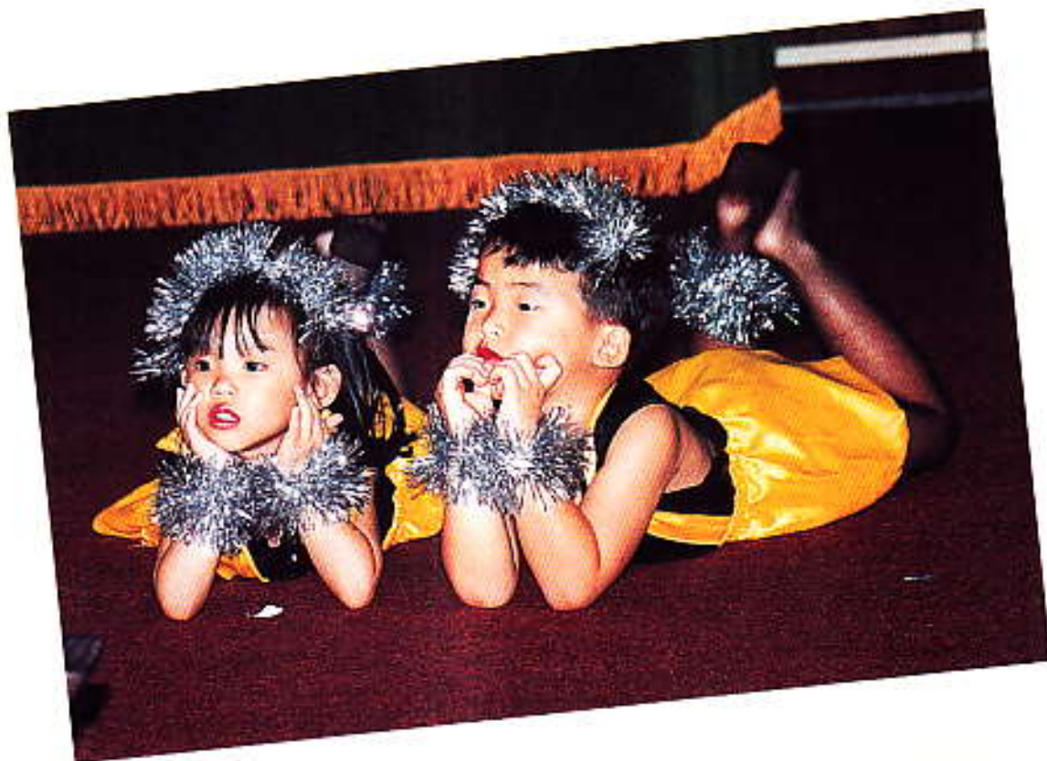
TMC Kindergarten 13th Graduation cum Concert

It was a poignant but spectacular concert put up by the teachers and children of TMC Kindergarten as this was their last graduation before the kindergarten was closed. The kindergarten will resume when the church redevelopment is completed in about 2 years time.